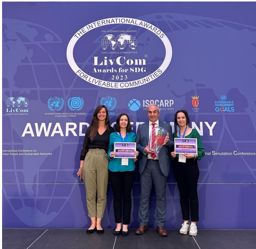
Delegation from the Municipality of Águeda