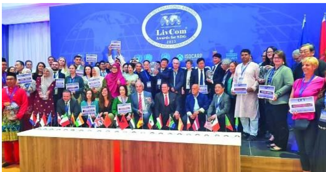
An image of the awarded cities.